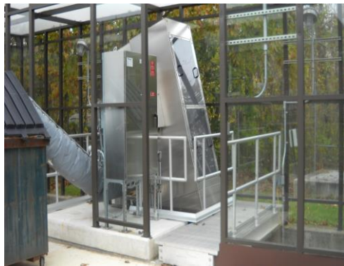
Raw Sewage Screen

The influent wet well is cleaned out by outside Contractors periodically as required.