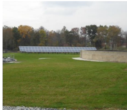
Solar Panels at WPCP Site

Since approximately 2006, the HMUA has been utilizing a maintenance management program software called “E-Maint” to keep track of the numerous routine maintenance tasks required to keep the equipment throughout the treatment plant operating efficiently and to increase the longevity of the equipment. The Chief Operator indicated that the “E-Maint” software has proven to be very helpful in keeping track and scheduling of the required maintenance tasks throughout the facility.