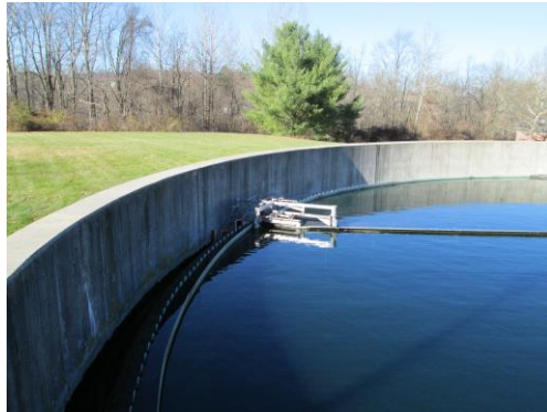
Final Clarifier – Weir Brush System