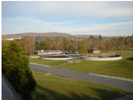
Water Pollution Control Plant Site

A 31.7 kW solar array was installed at the WPCP Site under a Power Purchase Agreement. The installation of the solar array was completed in September 2011, with an official ribbon-cutting ceremony on October 6, 2011.