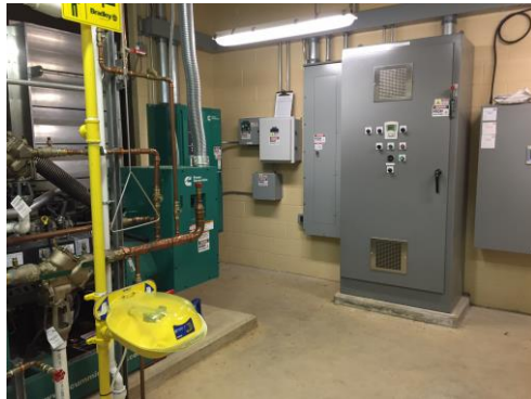
Well No. 9

Well No. 2 was taken out of service in early November 2010 due to a failed water quality test (detection of E-Coli). The well has remained out of service as is now no longer part of the Water Allocation Permit. The HMUA installed equipment to pump system water up to the IMG Tank. Well No. 2 has been abandoned and sealed and was decommissioned on December 11, 2012 as required by the Water Allocation Permit.