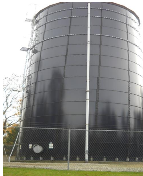
Independence Township Water Storage Tank

The Independence Township Water Storage Tank has been repaired for leaks in 2008, 2012 and again in the spring of 2015. No weepage was observed during our November 2015 field inspection and the exterior of the tank appeared to be in satisfactory condition.