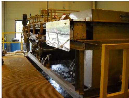
Gravity Belt Thickener

Sludge collected in the final clarifiers is wasted from the treatment system to a pre-thickened sludge holding tank at the Advanced Treatment system. The waste sludge is thickened prior to being trucked off-site (PVSC) for ultimate disposal using gravity belt thickeners located in the Advanced Treatment Building. The two (2) gravity belt thickeners are now over twenty (20) years old, but continue to operate very well, requiring only occasional miscellaneous repairs. In 2015, both belts were replaced, and a new compressor and new wash water pump were installed. A number of the rollers beneath the traveling belts are showing signs of wear and the HMUA has been periodically replacing these rollers as required. The gravity belt thickeners are typically operated three (3) days per week. The positive displacement pumps used in conjunction with the gravity belts are reported to have operated satisfactorily over the past year. In 2015, HMUA replaced one of the polymer control panels and two pumps. Spare parts are not readily available for the remaining existing polymer equipment. The thickened sludge mixer requires replacement.