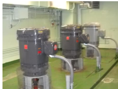
Raw Sewage Pump Motors