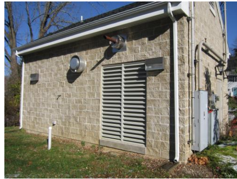
Well No. 8 Following Generator Installation